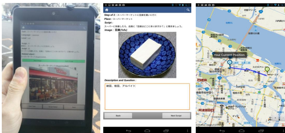
Figure 3. Learning Log Navigator interface.

Finally, after students achieve the destination, system will recommend learning log for them. After students select the task which they want to study, to gain the knowledge, the necessary information and the word, the image students didn’t know will be provided by system. For instance, when “after you achieve supermarket, you should ask clerk ‘Where can I find tofu?’” will be reminded by system, system will provide some words